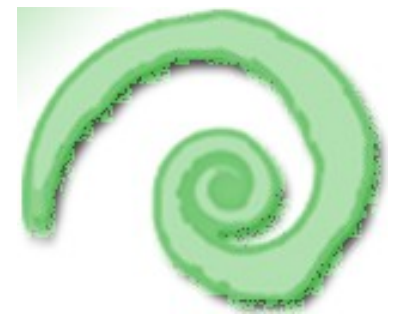
Logo of the host organisation CYCLISIS